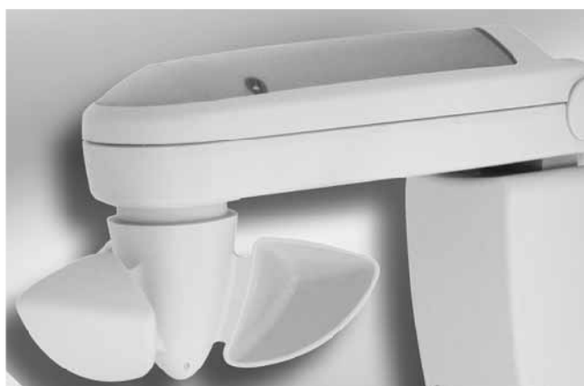
The radio-controlled wind and solar sensor comes in a modern design. Used to control radio-controlled drives and radio receivers